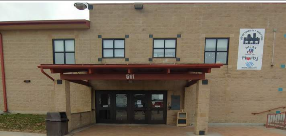
Amity is located in the King Community Campus